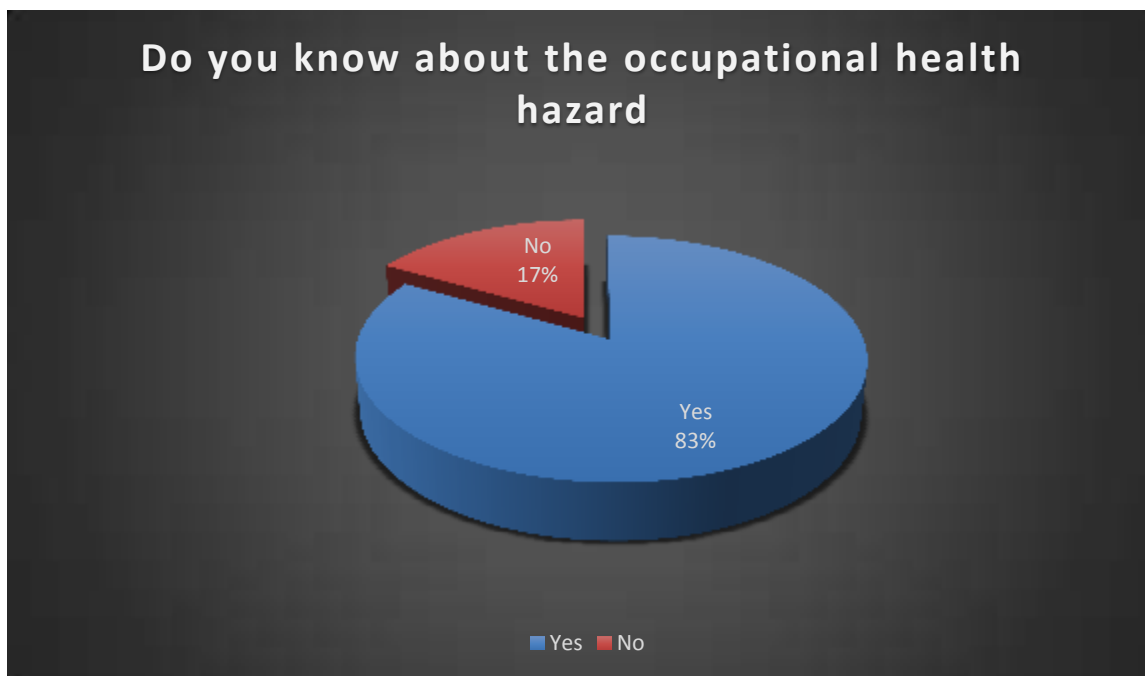
Figure 4.3 Distribution of the study participants according to knowledge about the occupational health hazard (n = 120)

As shown in figure 4.3 , when asked student “Do you know about the occupational health hazard” it was revealed that most 100 (83.3%) of the respondents said yes and 20 (16.7%) said no