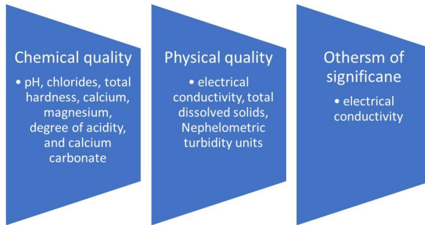
Figure (3): Parameters influencing WQL.

present study were found to range between 32 to 214 but \text{SO}_3 was found to be 432 mg/l for the canal water was 136. As such, water samples were all within the recommended standards, except \text{SO}_3 .