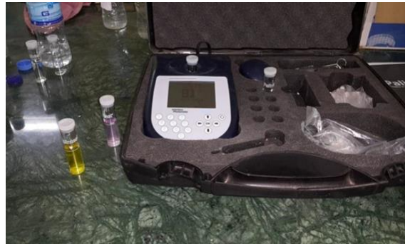
c. Palin test spectrophotometer