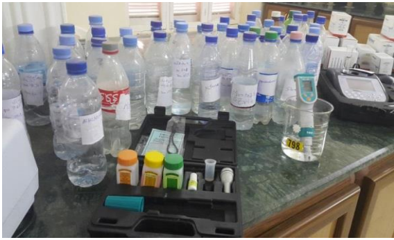
a. Water samples