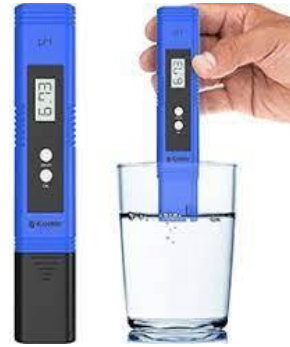
b. pH meter test